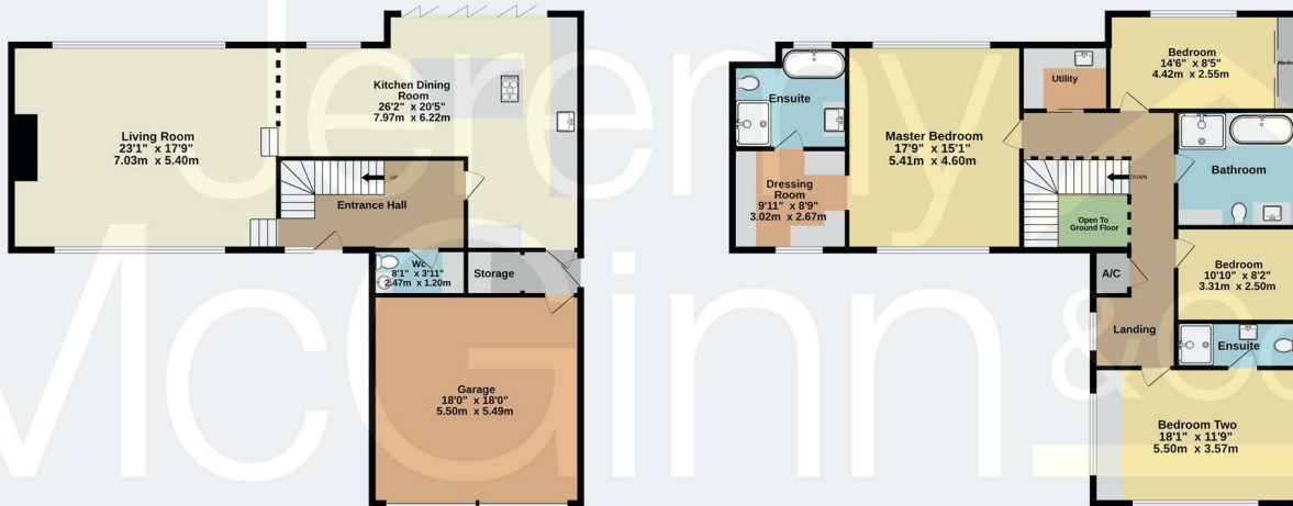
1ST FLOOR 1279 sq.ft. (118.8 sq.m.) approx.